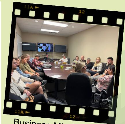
Business Mix & Mingle

Please register by emailing: reception@pace-cl.on.ca