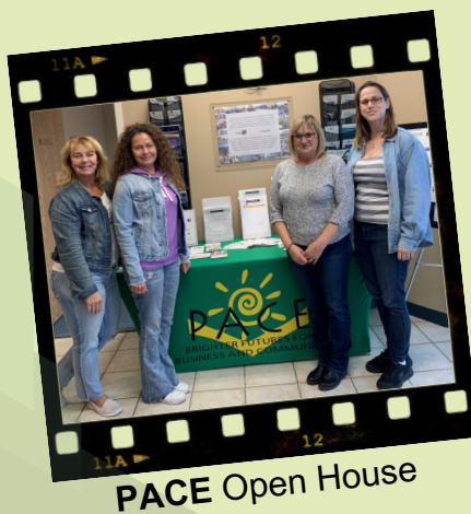
PACE Open House

Throughout the week, participating restaurants featured a burger made with local ingredients as part of Burger Bonanza. Over $260 was raised and donated to the Dryden Native Friendship Centre! PI Restaurant won the award for most creative burger, while Riverview Lodge sold the most burgers. It was a three-way tie between PI, Riverview Lodge, and B&B Restaurant for the best burger!