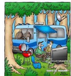
"There's nothing like roughing it in the woods to make a man feel alive!"